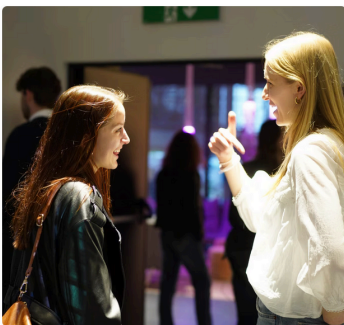
ESCP Turin Branch Italy