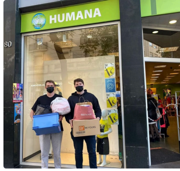
ESADE Branch Barcelona