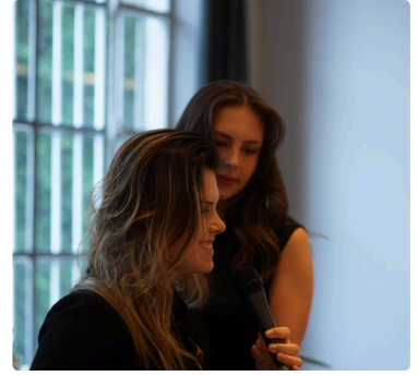
ESCP Turin Branch Italy