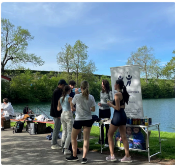
St. Gallen Branch Switzerland

SPF has a valuable and relevant mission that we wish to represent to fellow students and contribute to public awareness of charitable work.