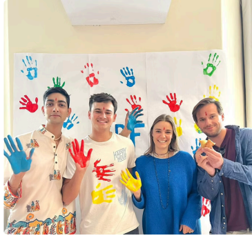
ESCP Turin Branch Italy