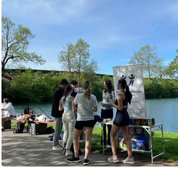
St. Gallen Branch Switzerland