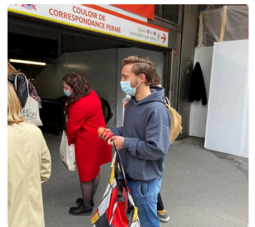
ESCP Paris Branch France