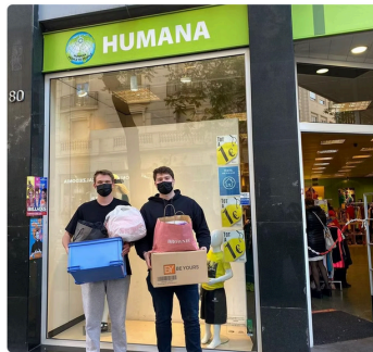
ESADE Branch Barcelona