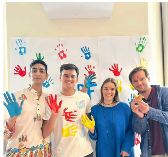
ESCP Turin Branch Italy