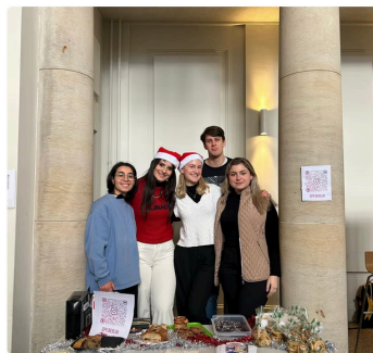
ESCP Berlin Branch Germany