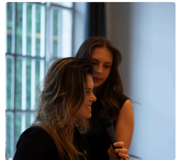
ESCP Turin Branch Italy